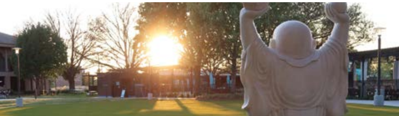
White Marble Happy Buddha, Hilton Anatole Art Collection